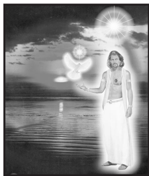
• 8 x 10 COLOR PRINT • "Blessings from Sananda" by Hallie Deering